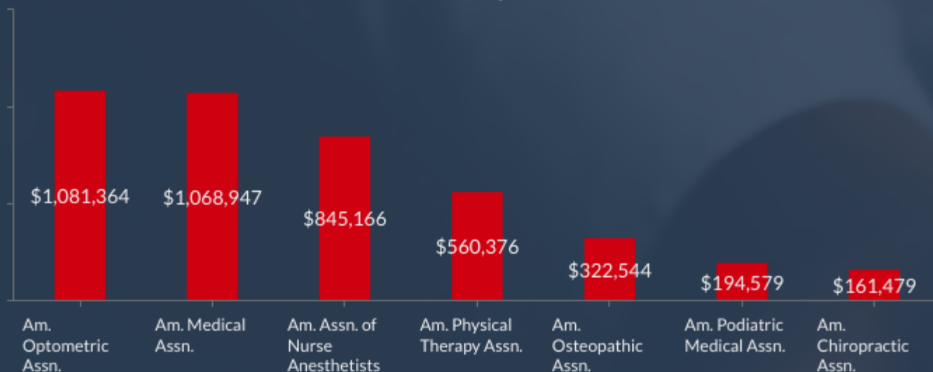
2022 PAC Receipts

Many of the organizations listed have differing views on some of the issues that are important to us in chiropractic medicine. It is vital that we are able to amplify our voices among the other healthcare provider groups in the public policy arena -- to advocate for our practices and our patient's access to broad-based, non-drug approaches to pain management.